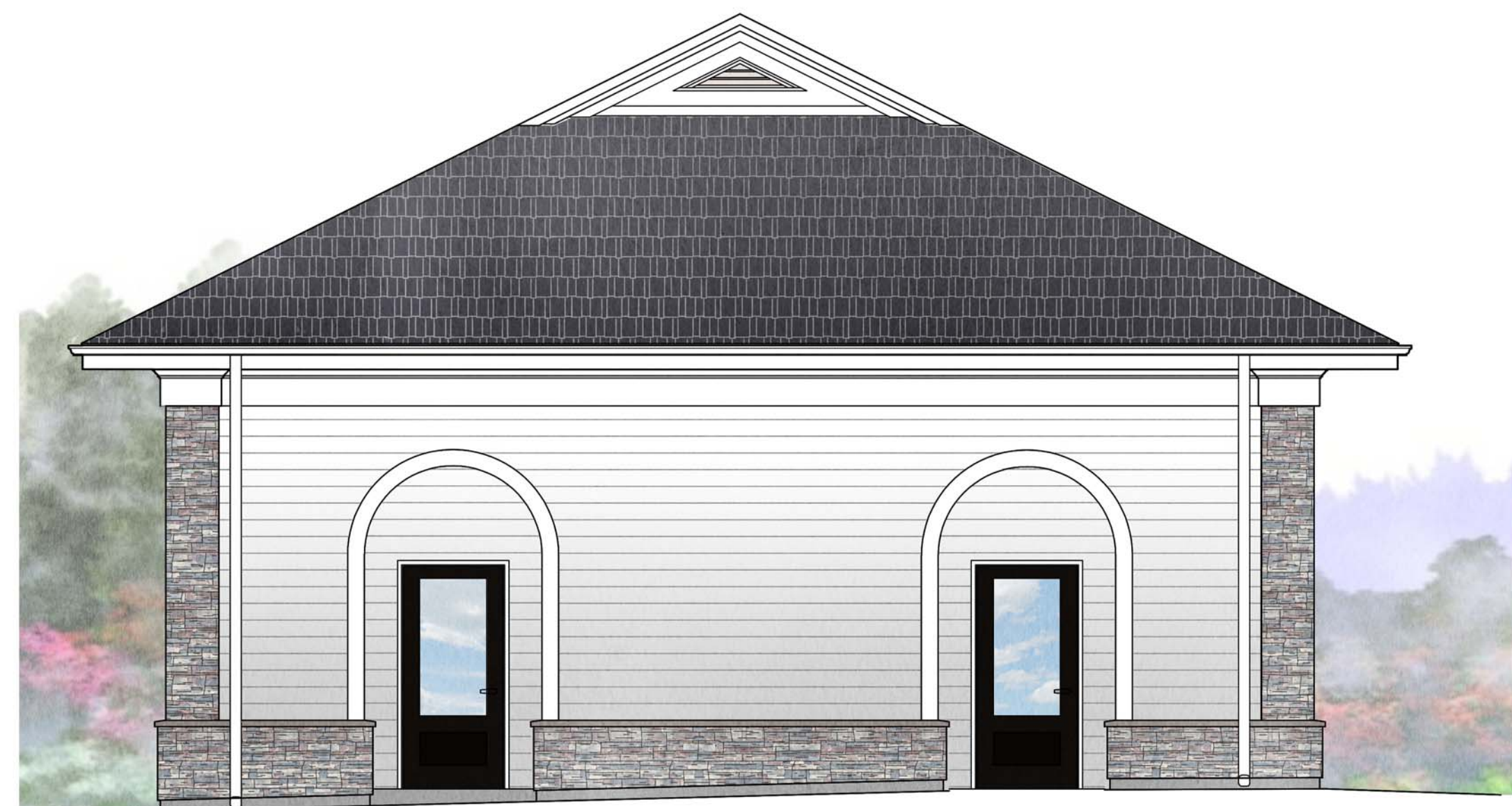
2 A1.1 SIDE ELEVATIONS SCALE: 1/8" = 1'-0"