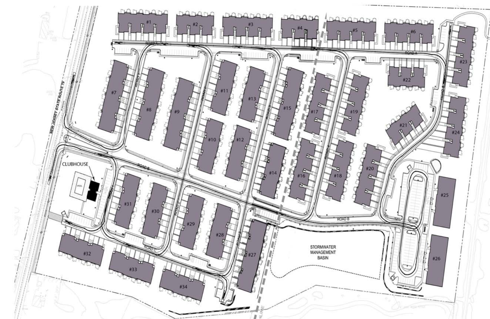
4 A1.1 KEY PLAN SCALE: N.T.S.

NOTE: THIS PLAN IS NOT FOR CONSTRUCTION AND IS SUBJECT TO CHANGE. THE BUILDER RESERVES THE RIGHT TO MAKE CHANGES AS NEEDED DUE TO MARKET CONDITIONS AND AVAILABILITY OF MATERIALS AS TO THE FLOOR PLANS, ROOM LOCATIONS, ELEVATION DESIGN, AND BUILDING MATERIALS INCLUDING COLORS AND TEXTURES.