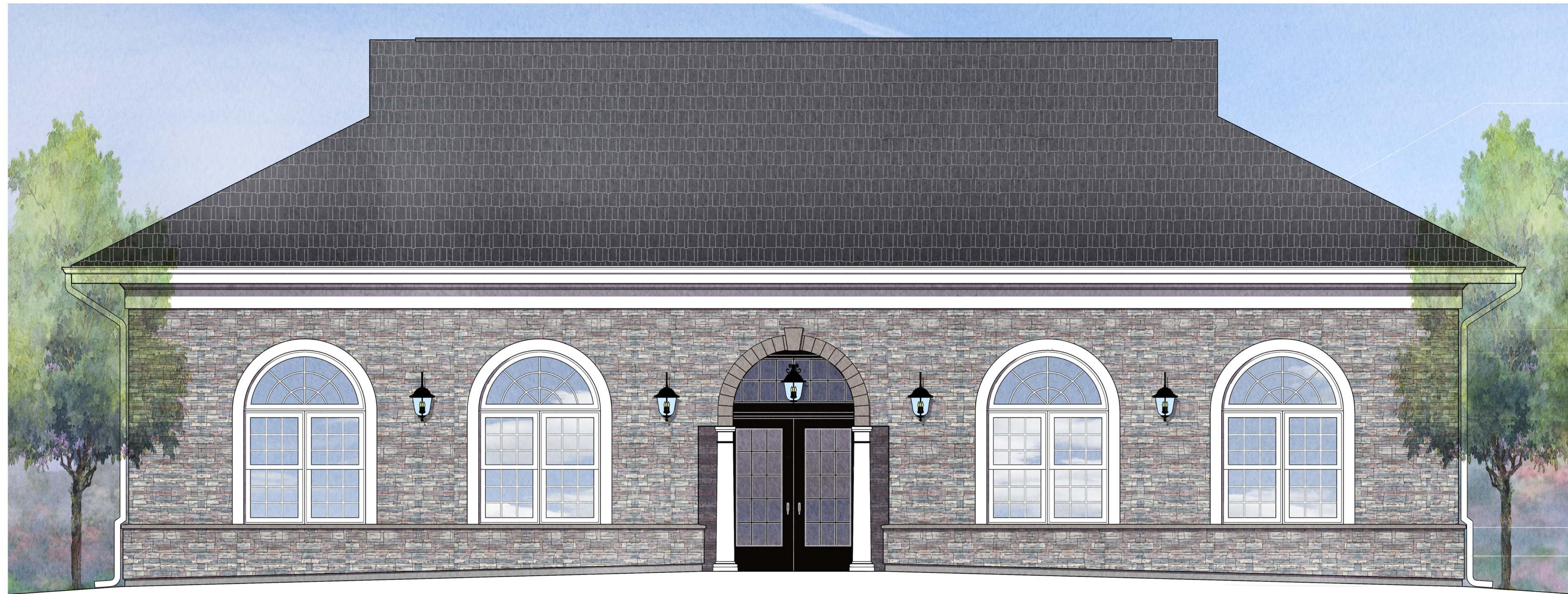
1 A1.1 FRONT ELEVATION (REAR ELEVATION SIMILAR) SCALE: 1/4" = 1'-0"