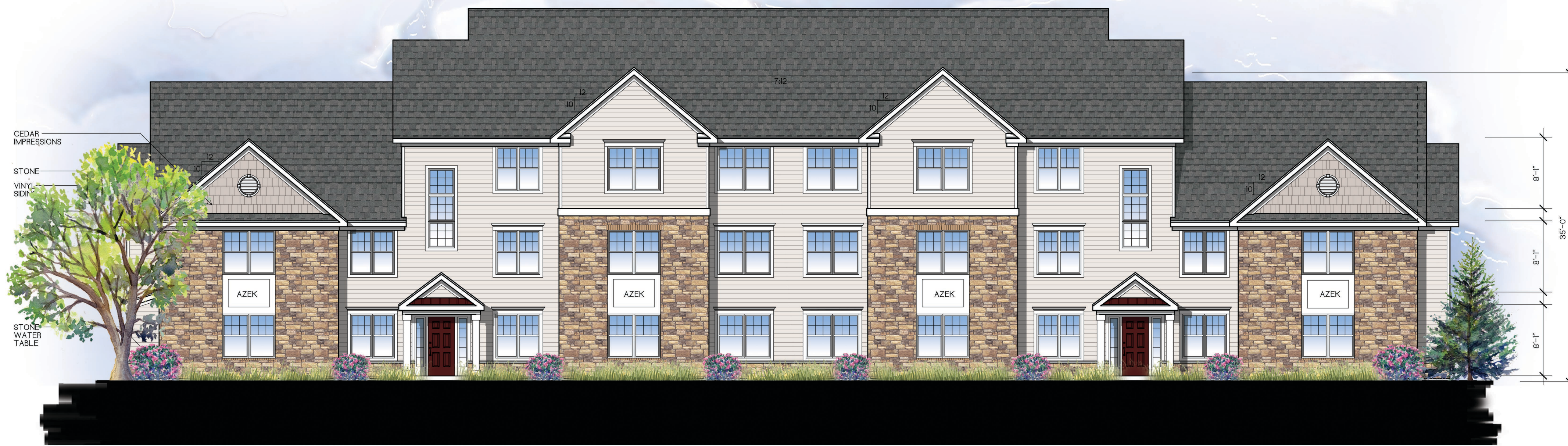
Front Elevation Scale: 1/8"=1'-0"