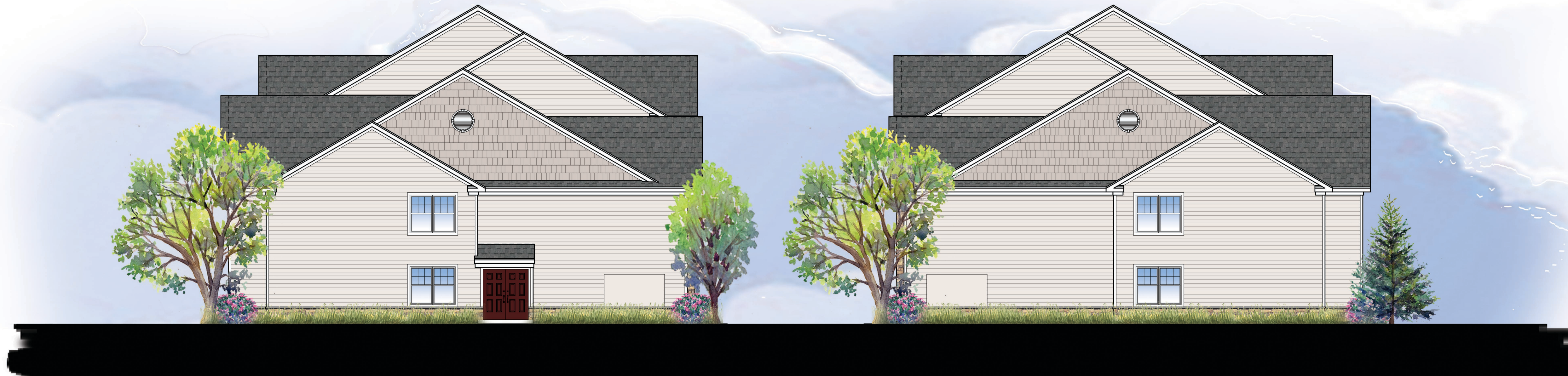
Left Elevation Scale: 1/8"=1'-0"