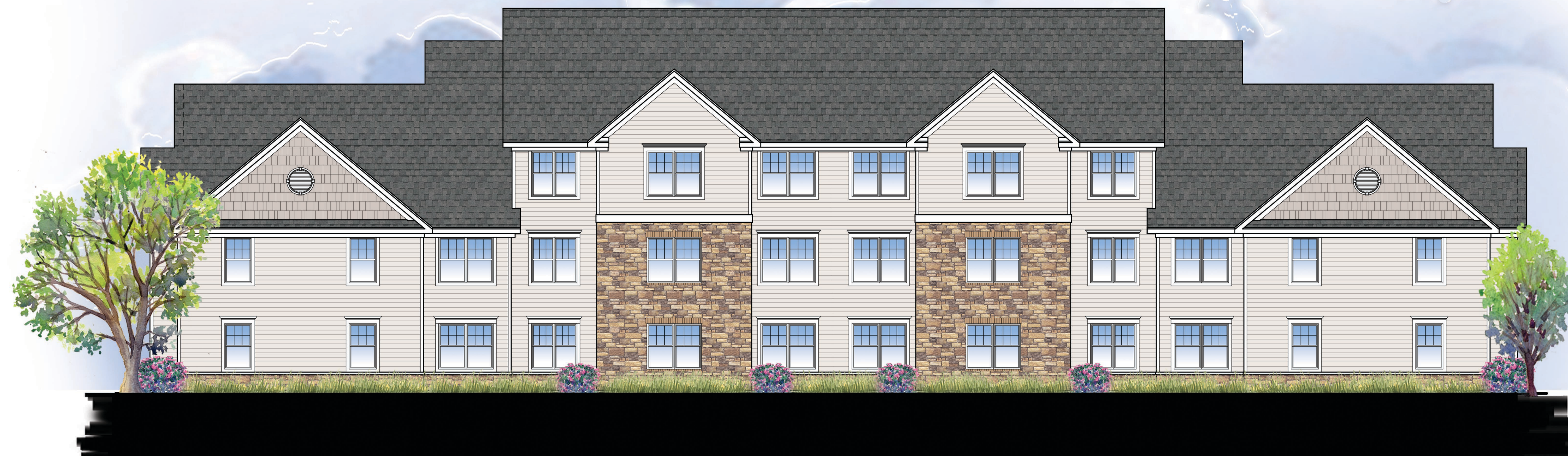
Rear Elevation Scale: 1/8"=1'-0"

Managed By: BDL Drawn By: AB Checked By: Redlined By: Date: Issue For Permit: Issue For Review: 01-21-20 Issue For Construction: Revisions: