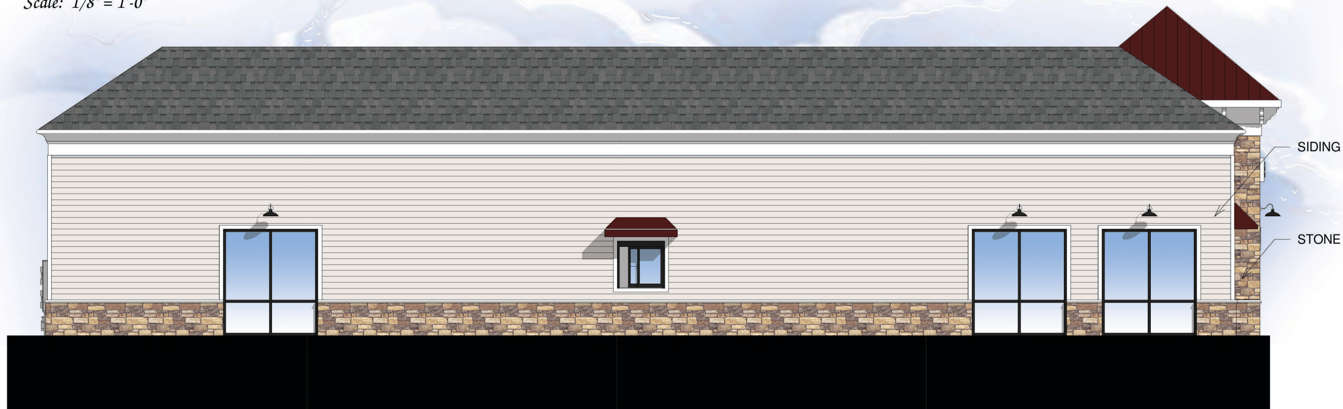
Left Elevation Scale: 1/8" = 1'-0"