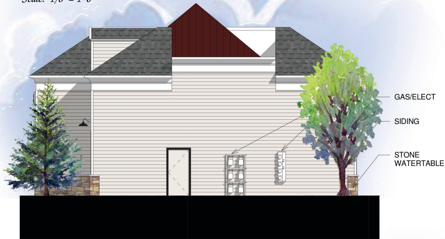
Rear Elevation Scale: 1/8" = 1'-0"