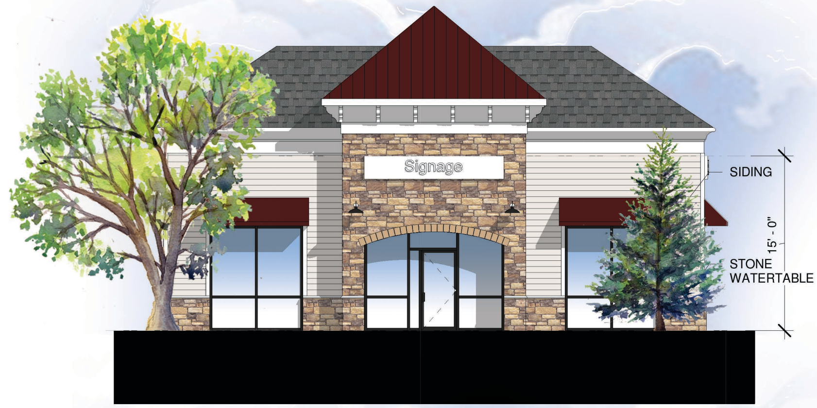
Front Elevation Scale: 1/8" = 1'-0"