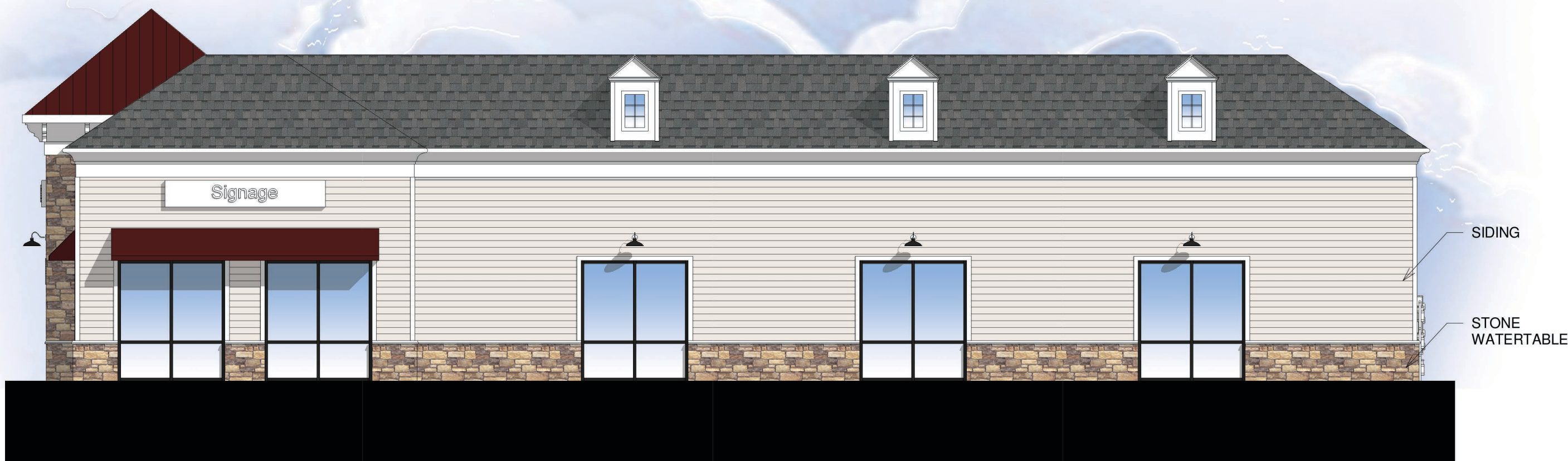
Right Elevation Scale: 1/8" = 1'-0"